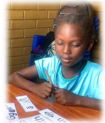
Learning sight words.

Witnessing this transformation in our students is an incredibly humbling experience. When they reach the milestone of completing 100 successful reading lessons, they receive a certificate and their very own Bible. For most of these children, this is the first book their family owns ever. We are grateful that they can discover God's Word for themselves for the first time.