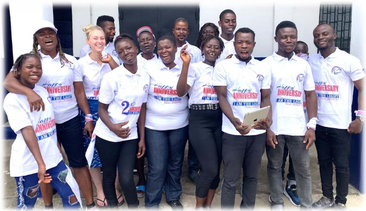
Open Bible Fellowship Members