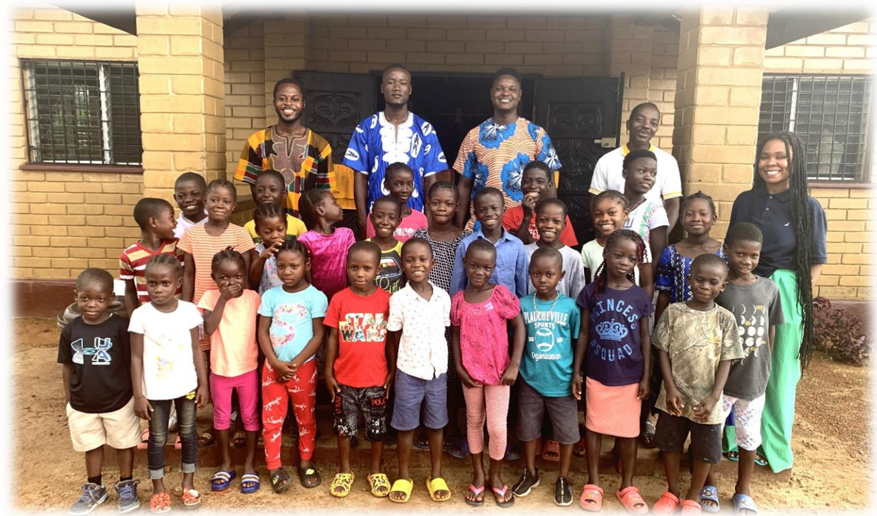
Current Legacy Learning Class

This surprising change has not only occurred in their education, but we have also witnessed the remarkable change in their behavior. Growing up in a community rife with violence (where mob justice prevails, domestic abuse is common, and suspicions of witchcraft lead to disappearances), these students lack a moral foundation aligned with biblical principles. Upon entering our program, these students often resort to physical confrontation and harsh language to resolve conflicts. Throughout the academic year, we inundate them with Scripture, engage in Bible songs, and share Bible stories that emphasize love and compassion. At the end of the year, we witness a profound evolution: these students begin to collaborate to solve problems and express themselves with more patience and understanding.