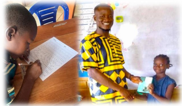
Learning to write.

Witnessing this transformation in our students is an incredibly humbling experience. When they reach the milestone of completing 100 successful reading lessons, they receive a certificate and their very own Bible. For most of these children, this is the first book their family owns ever. We are grateful that they can discover God's Word for themselves for the first time.